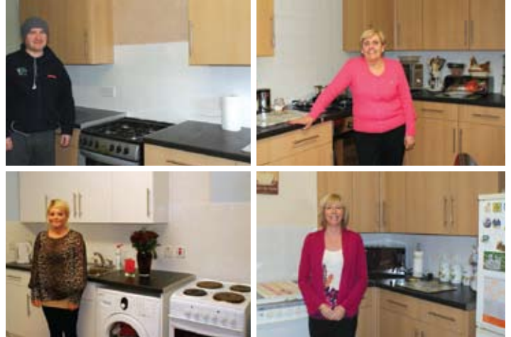
February 2012: Tenants happy with their new kitchens

The following works are scheduled to be carried out during the financial year April 2012 to March 2013: