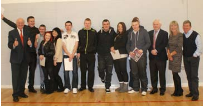
The presentation event at Centre81

You may remember that we advertised in our September ChitChat for 16 – 18 year olds to take part in a local painting challenge. Well we are delighted that since then, we have been able to assist in the successful delivery of a Challenge project in partnership with Action for Children/ Inspiring Scotland for the benefit of our tenants and residents, local community and of course for the young people themselves.