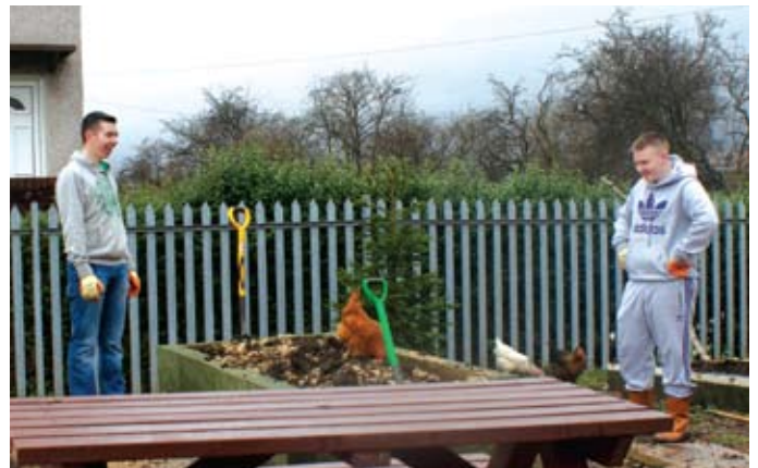
A cheeky chicken disrupts the volunteers work!

WCG is looking for volunteers to help out in the garden and help with the chickens. They would also be grateful for contributions, so if you have any surplus garden materials that you would like to donate, such as slabs, plants, old garden tools, unwanted hanging baskets (regardless of their condition) and so on, please call Carolanne on 07871 910448.