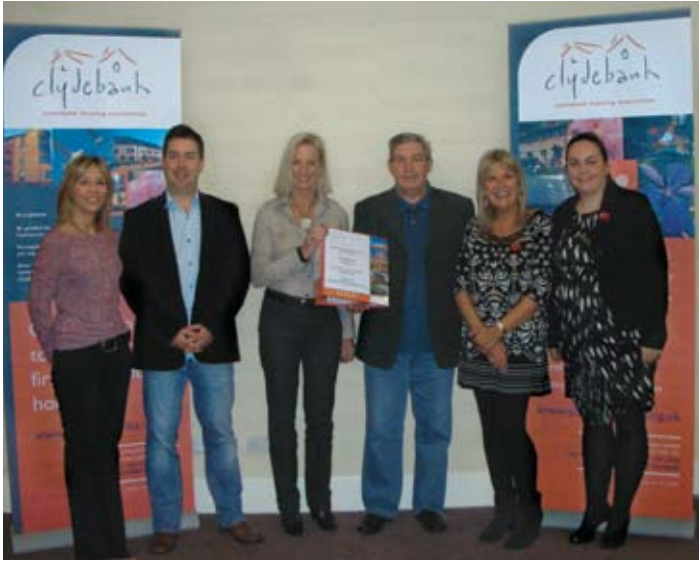
Our Senior Staff and Chairman present the Business Plan

We are delighted to have been selected as the proposed landlord for the West Dunbartonshire Council's (WDC) transfer of 1,211 Clydebank East properties.