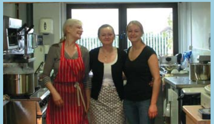
The friendly café staff

With a £35,000 grant from the Environment Trust the old play area in Braes Avenue in Whitecreek, which lay derelict for many years, has been transformed in to a wonderful play space for children and families. The newly upgraded park, named Park81, an idea from a user of Centre81, includes swings, springfish, stepping pods and a toddler zone surrounded by greenspace. We are delighted that the space opposite Centre81 has been transformed in to a fabulous park and hope that the local community will enjoy using it.