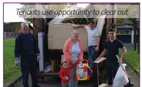
Tenants use opportunity to clear out