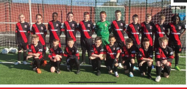
For more information on the team visit their facebook page <u>https://</u> <u>www.facebook.com/</u> <u>ClydebankFC2011s</u>.