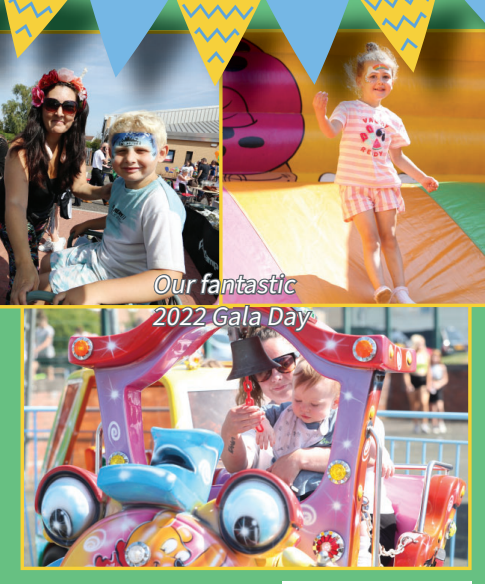
Free fairground rides provided by

Free fairground rides ~ cupcake making ~ raffle ~ BBQ ~ DJ ~ bike maintenance ~ community garden products ~ tea/coffee stall