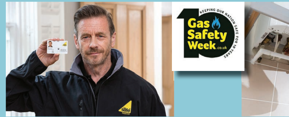
Always ask to see your engineer's Gas Safe ID Card

If you receive notification that your boiler service is due and you have any concerns whatsoever about granting access to your property, please contact our Programmed Maintenance Team on 0141 941 1044 where they will be happy to discuss this or you can email the team at programmed. <u>maintenance@clydebank-ha.org.</u> <u>uk.</u>