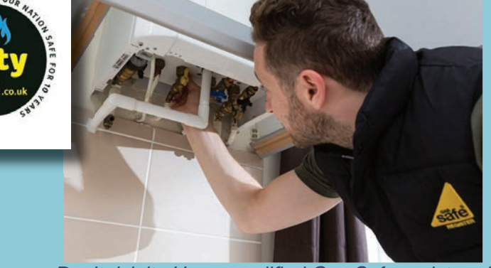
Don't risk it. Use a qualified Gas Safe registered engineer to fix, fit or repair your applicance