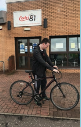
Two happy customers!