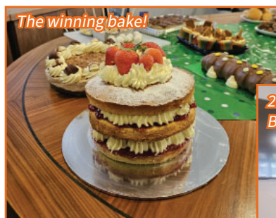
The winning bake!