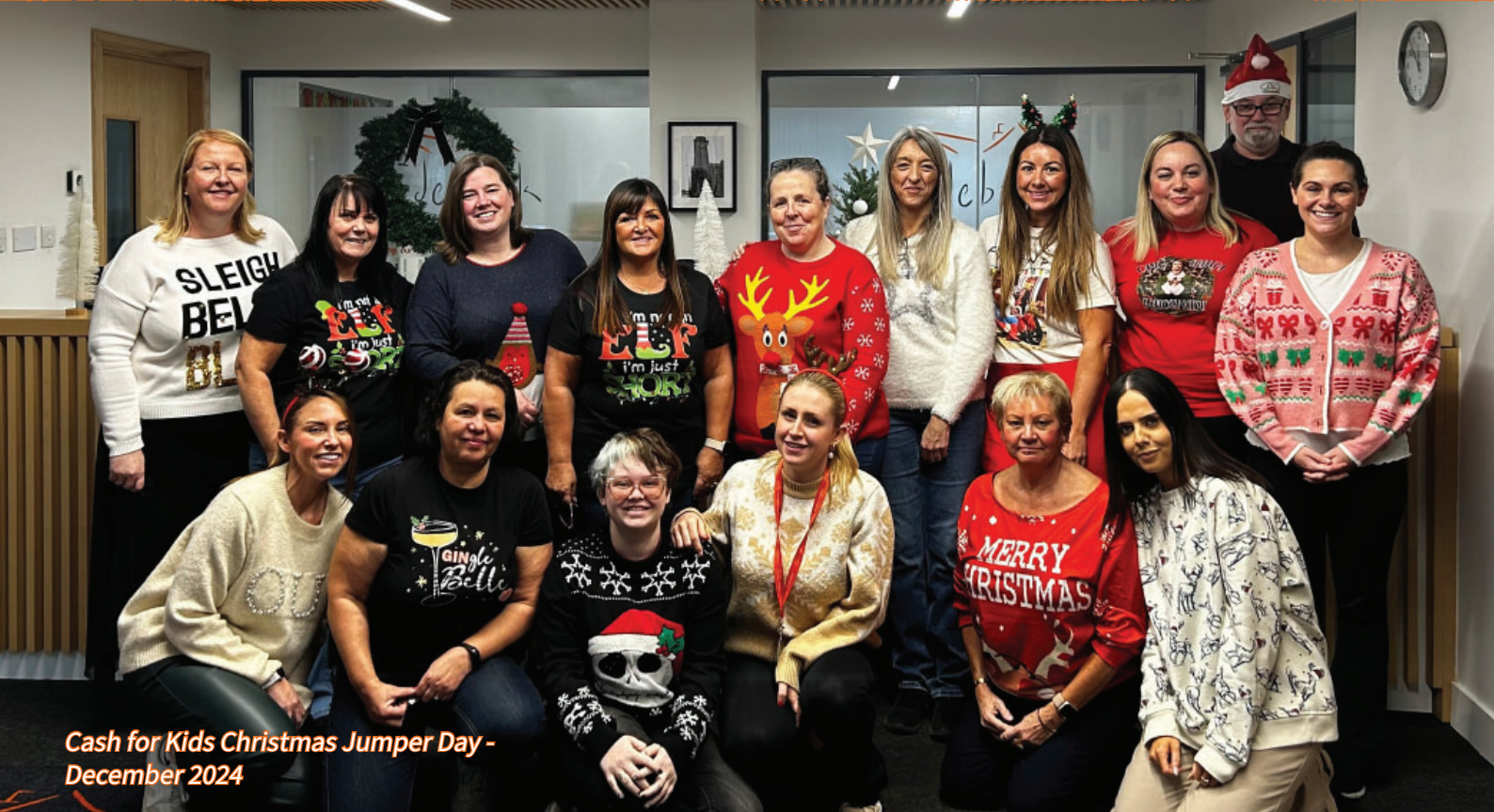
Cash for Kids Christmas Jumper Day - December 2024